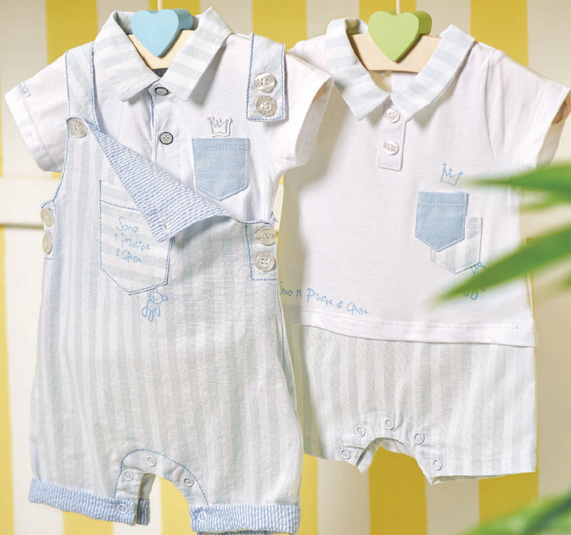
Tutina estiva/Summer romper 4U085