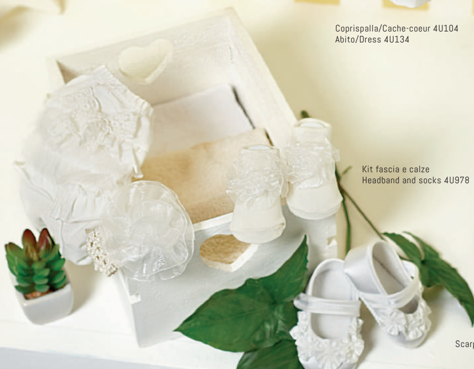
Kit fascia e calze Headband and socks 4U978