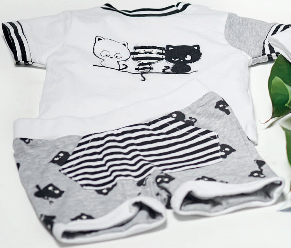
Completo 2 pz/2 pcs set 4U625