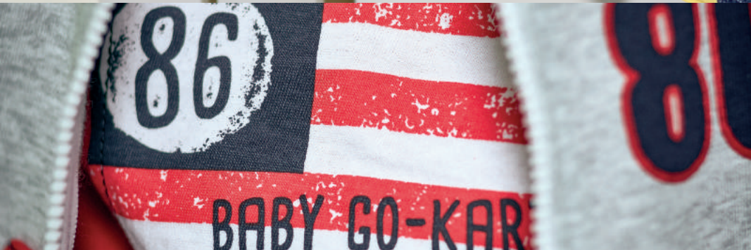
Cardigan 4U028 Camicia/Shirt 4U061 Pantalone/Trousers 4U051 Papillon/Bow tie 4U952 Cappello/Hat 4U950